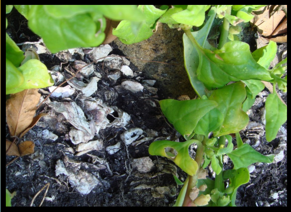
Above: Warrigal Spinach growing over a shell midden.