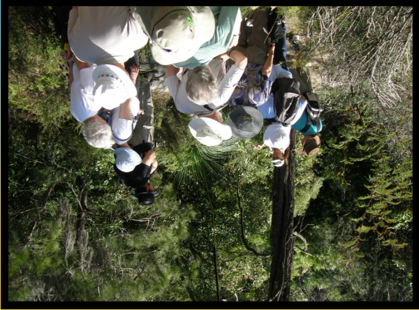
Above: AHO Sites Awareness training.