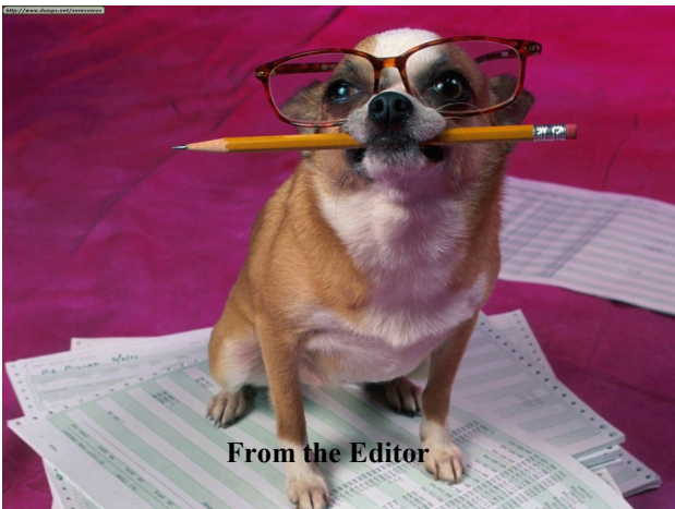
From the Editor

A man walks into a bar on the top floor of a skyscraper. He sits down and orders a beer. After taking a drink he sees the guy next to him go over to the window and jump out! "Holy cow! Did you see that!?! That guy just jumped out the window!" The bartender does nothing. So the man takes another sip. A minute later the same guy walks in, orders another drink, chugs it, and jumps out the window again. "Jesus! He just jumped again!" The bartender ignores the man. So the man sits puzzled. The guy comes back into the bar, and orders another drink. "How did you survive that jump?".."I ordered a floatie drink, if you drink it in a certain amount of time, you can float." So the guy quickly orders a floatie drink. He takes it from the bartender, and chugs it. He then jumps out the window and...SPLAT! Right on the sidewalk! The Bartender then say s, "You know, Superman...you can be a real jerk when youre drunk."