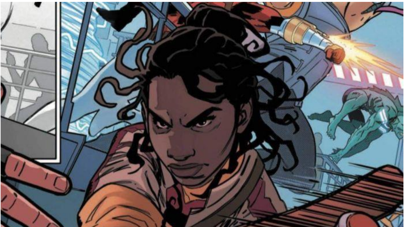
Thylacine in Suicide Squad #5.

Code Name Thylacine, Corinna in her daily life, she is a deadly Ngarluma hunter from the Pilbara region of Western Australia. Her Super Skills are night vision, heightened senses, lethal combat skills, Batman-like stealth, and a steely gaze. She is the only character that can walk into any situation get the job done and walk out again - alive.